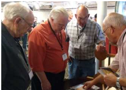
Matching Room Divider