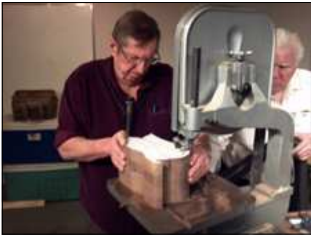
Step 7: Cut out drawer(s)