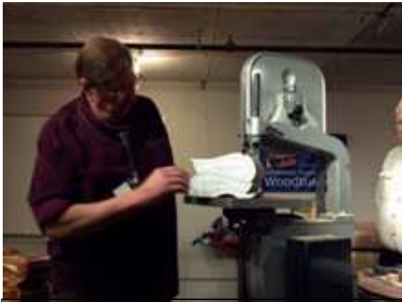
First, design. Second, make pattern. Third, attach pattern to workpiece. Fourth, cut out the outside of the box. Fifth, arrive at WWG for demonstration.