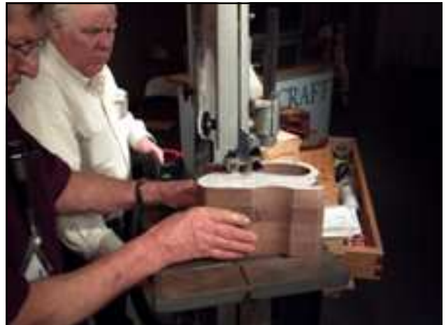
Step 7: Continue cutting out drawer(s)