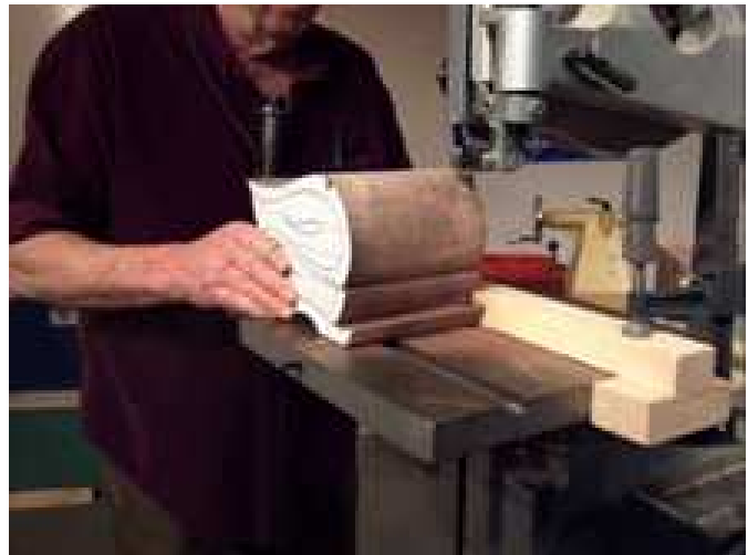
Step 6: Cut off back of workpiece.