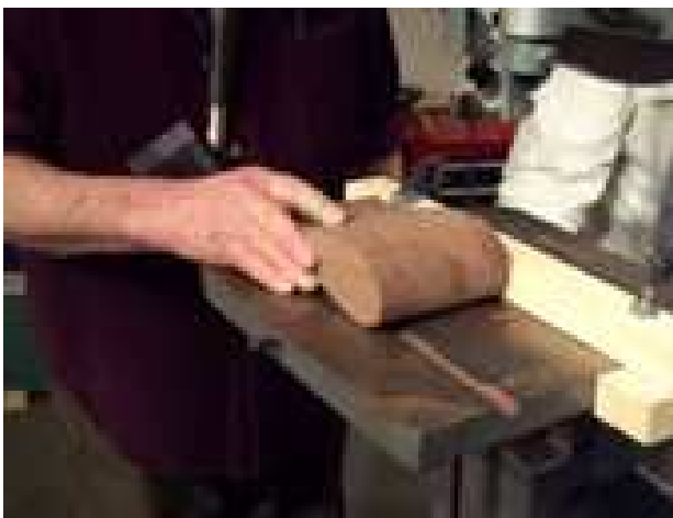
Step 8: Cut off front and back of drawer(s)