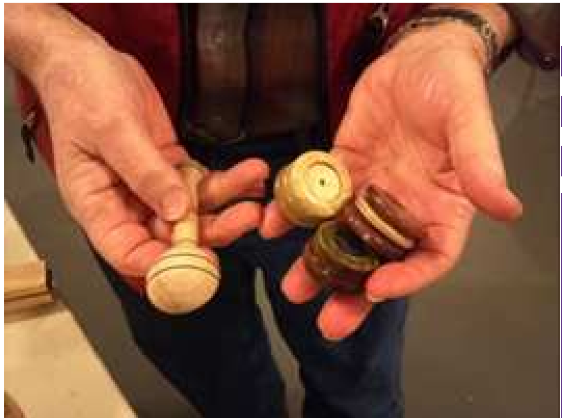
Jay also brought in these items to show that he has the 'tall' of it as well as the 'small' of it.