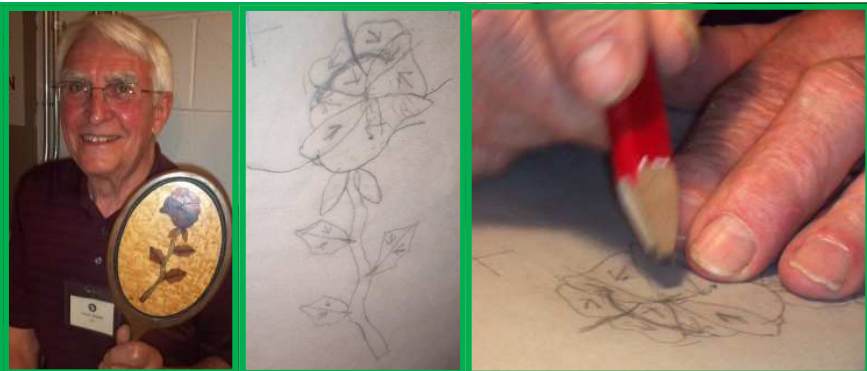
Scroll Saw Marquetry Lou Enderle